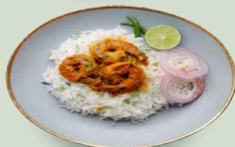
PRAWN MASALA CURRY (CONTAINS COCONUT)