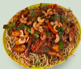
DRAGON SPICY PANEER (INDIAN CHEESE)