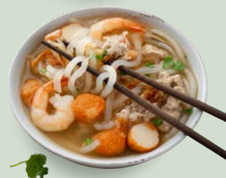
PRAWNS AND FISH BALL NOODLE SOUP