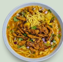
MUTTON/LAMB NOODLE SOUP (NEPALESE STYLE THUPKA )