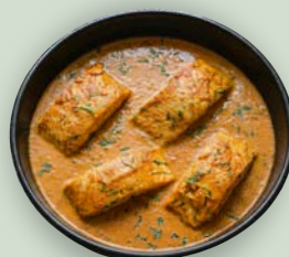
SALMON MASALA CURRY (CONTAINS COCONUT)