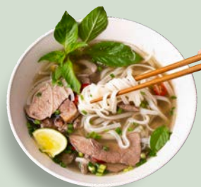
BEEF PHO NOODLE SOUP