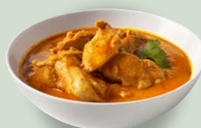
MUGHLAI CHICKEN (CONTAINS NUTS)