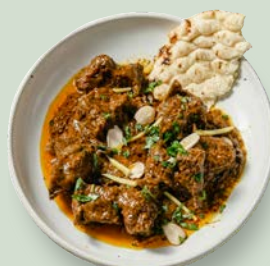
LAMB /MUTTON KORMA (CONTAINS NUTS)