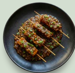
PANEER SATAY WITH HOMEMADE PEANUT DIPPING SAUCE