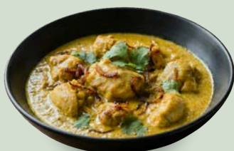
CHICKEN KORMA (CONTAINS NUTS)