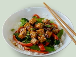
THAI RED/GREEN CURRY - WITH TOFU & VEGETABLES