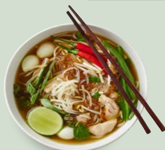
CHICKEN PHO NOODLE SOUP