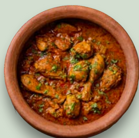
CHICKEN HANDI ( NUT FREE DISH)