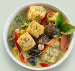
CASHEW TOFU STIR FRY