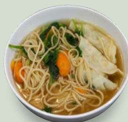
CHICKEN DUMPLING & NOODLE SOUP